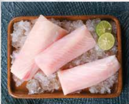
Cobia Fish Portion