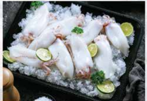
Loligo Squid Whole Cleaned