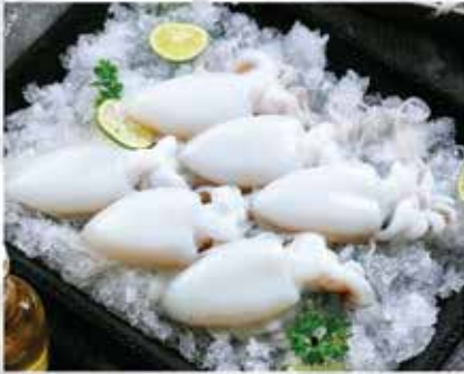
Cuttlefish Whole Cleaned