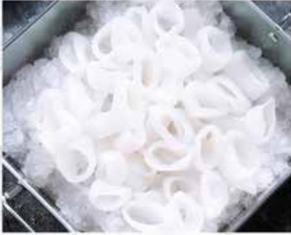
Loligo Squid Ring